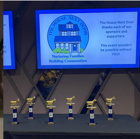
Goat trophies were handed out to the bay competitors who had the best score. The goat stands for "Greatest Of All Time"